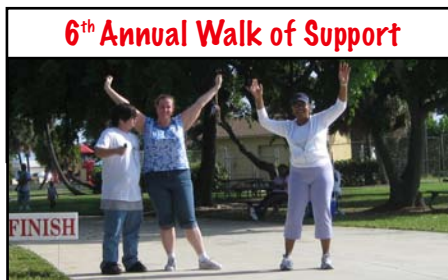
6th Annual Walk of Support