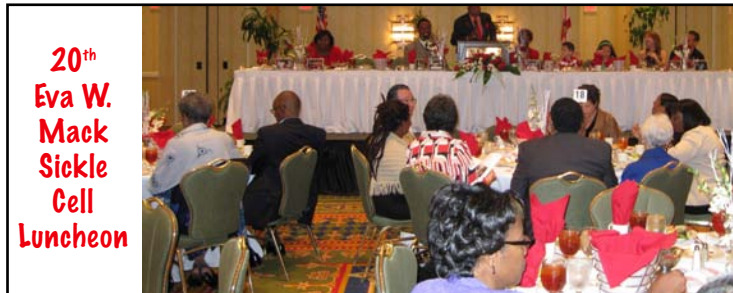
20th Eva W. Mack Sickle Cell Luncheon

Make the switch and support your local Sickle Cell Foundation. Visit your local tag office or www.myflorida.com . Twenty-five percent of funds generated from the sale of the Live the Dream specialty license plate are distributed equally among Sickle Cell Organizations that are Florida members of Sickle Cell Disease Association of America.