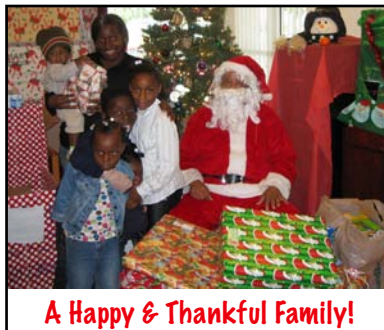
A Happy & Thankful Family!