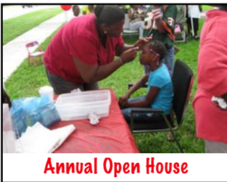
Annual Open House